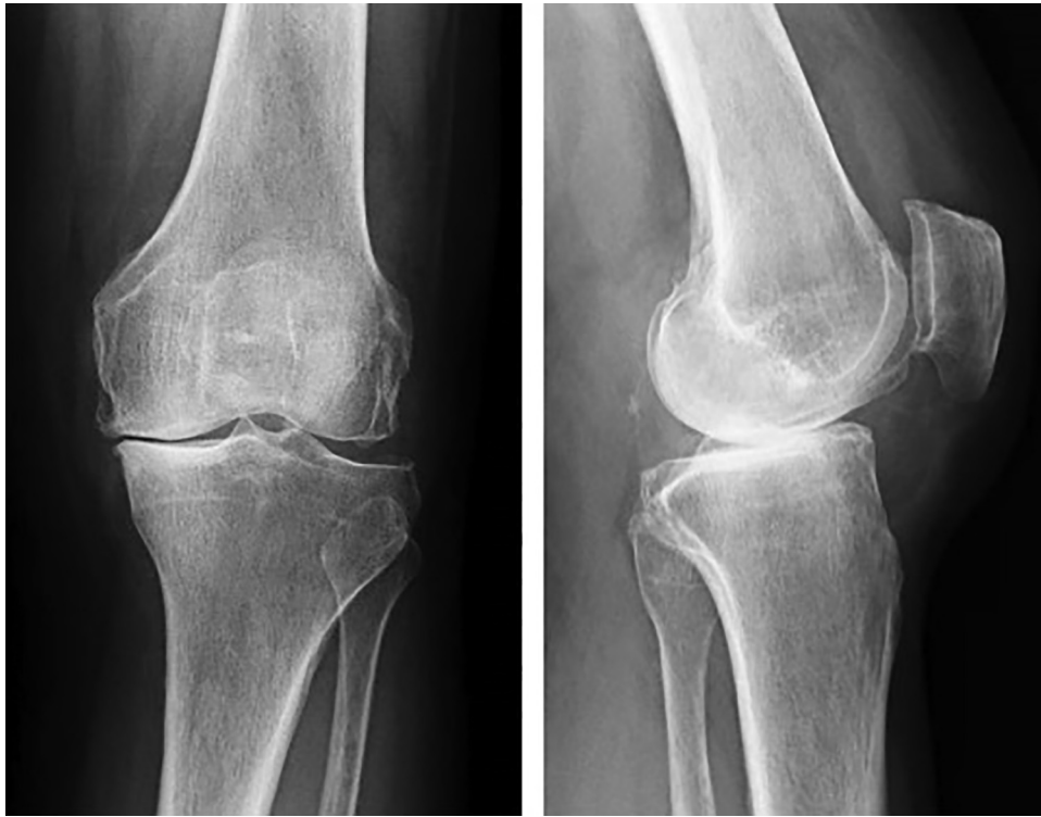
Fig. 1. Preoperative weight-bearing radiographs showing bone-on-bone AMOA. The presence of osteophytes in the lateral compartment is not a contraindication for UKR using the Oxford criteria.