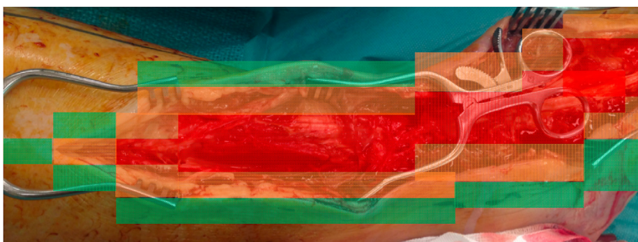
Fig. 1d. Illustration of the red amber and green technique. Each area has been colour-coded to include the different areas for debridement. Exploration must warrant the assessment of all tissues that are related to infection, including the spread along tendon sheaths to muscle bellies and into fascial planes. (For interpretation of the references to colour in this figure legend, the reader is referred to the Web version of this article.)

clinical cases, empirical antibiotics must be started. Culture specific antibiotics should be instituted once bacterial isolation and identification has been achieved and are continued until there is clinical and serological evidence of infection eradication. Manas et al. (2020) compared deep wound swab taken from admission through the actively infected tissue against subsequent surgical bone sample taken during surgical debridement. 21 Concluding only a fair concordance between the 2 specimens. Unlike, radical tumour surgery, intra-operative bone and tissue sampling during the primary debridement aim to identify the relevant bacteriology.