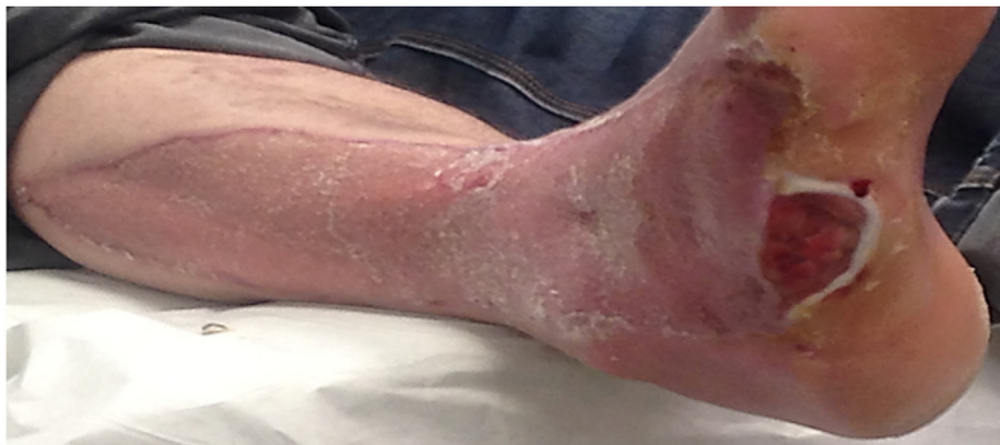
Fig. 1c. at 1 year the wounds have healed, but a recurrent ulcer had developed as a result of muscle – tendon imbalance. The patient was counselled for definitive reconstructive fusion surgery with a hind foot nail due to hind foot inversion and lateral plantar surface overload.