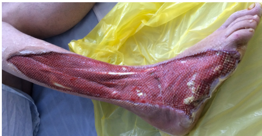
Fig. 1b. 3 weeks after the first debridement, a split skin graft was second debridement was undertaken, in between a second debridement and wound monitoring with bedside podiatric debridement was continued.

IWGDF guidelines suggest that the culture-specific antibiotic therapy is of crucial importance in all diabetic foot infections and IWGDF guidelines strongly recommend appropriate, reliable sampling techniques to determine the causative pathogen. 16 In urgent